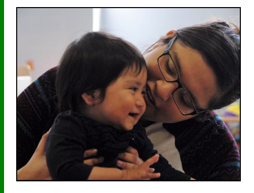
Children & Staff